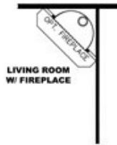
LIVING ROOM W/ FIREPLACE