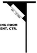
LIVING ROOM W/ ENT. CTRL.

Our home building facilities invest in continuous product and process improvements. Plans, dimensions, features, materials, specifications and availability are subject to change without notice or obligation. Renderings and floor plans are representative likenesses of our homes and may differ from the actual homes. We invite you to tour a Home Center near you and inspect the highest value in quality housing available or call (740) 423-9724 to speak with a Home Consultant. Copyright 2017, CMH. All rights reserved.