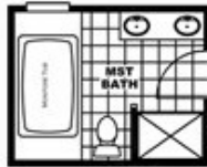
OPT. GLAMOUR BATH